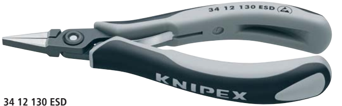
34 12 130 ESD ⚠️ ✳️ ◻️ ◻️ ◻️ ◻️ ◻️